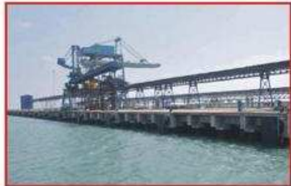
VIEW OF IRON ORE BERTH WITH SHIP LOADER & CONVEYOR SYSTEM

Your company had signed an agreement for an Iron Ore terminal on a 30 years BOT basis on 23 rd September 2006 with the project company SICAL Iron ore Terminal Limited with an approved project cost of ₹ 480 crores in two phases of 6 million tonnes each. The Licensee has developed the first phase of 6 MTPA capacity at an investment of ₹ 360 crores. The commissioning activities depend on the permits on the movement of export of Iron Ore by State Government of Karnataka and Hon'ble Supreme Court.