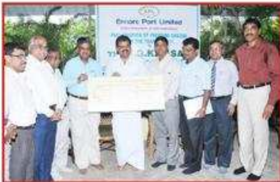
HANDING OVER OF 3 RD DIVIDEND CHEQUE TO HON'BLE UNION MINISTER OF SHIPPING

The Board of Directors has recommended a dividend of 20% on post tax profits which is equivalent to ₹ 0.65 per share keeping in mind the need to conserve resources. The dividend will absorb a sum of ₹ 22.48 crores including dividend distribution tax and surcharge thereon.