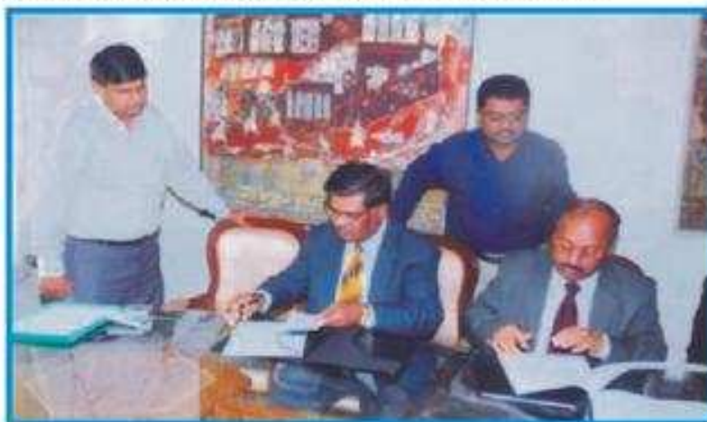
MoU SIGNING FOR THE YEAR 2012-13