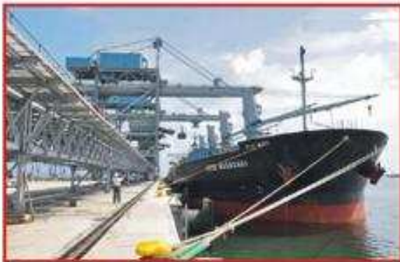
COAL UNLOADING AT CICTPL TERMINAL

Your Company had signed a License Agreement for handling coal to the consumers other than TNEB, on a 30 year BOT basis, in September 2006 with the project company Chettinad International Coal Terminal Pvt. Ltd (CICTPL) with an approved project cost of ₹399.13 crores. The Licensee has developed a terminal with a cargo handling capacity of 8 MTPA. The commercial operations began from 11 th March 2011. During the first full year of operation, CICTPL handled 3.49 MT of coal.