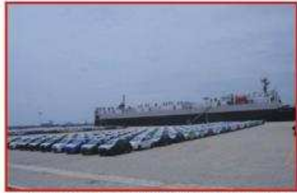
CAR EXPORT OPERATION AT GENERAL CARGO BERTH Iron Ore Terminal (12 MTPA):

Your company has set up a berth for car export and for other general cargo, at an estimated cost of ₹ 110 crores. This berth will be able to accommodate the world's largest car carrier of capacity of 8,000 cars. Further it has a back-up area of about 1,41,000 sq.m with an expansive car parking yard for 10000 cars which is the largest facility in any Indian Port. During the first full year of operation the terminal handled 103576 cars, 48 buses and 43 trucks.