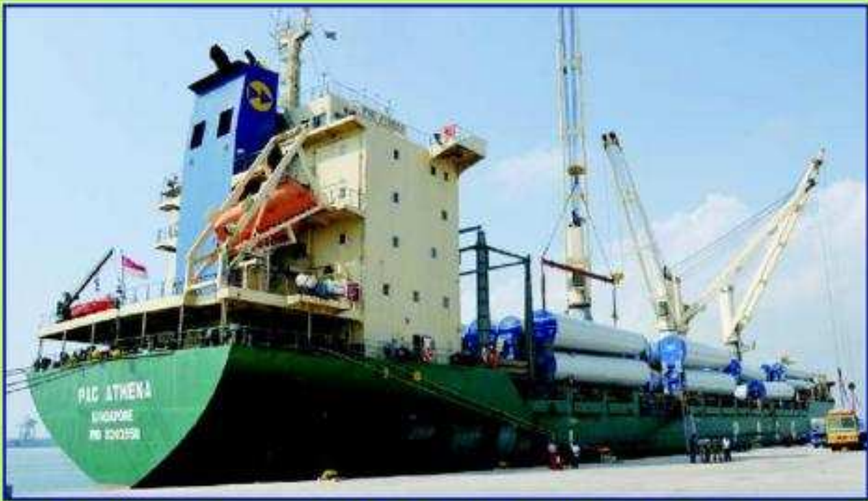
The first project Cargo vessel 'M.V. PAC ATHENA' berthed at Ennore Port on 27.1.2012