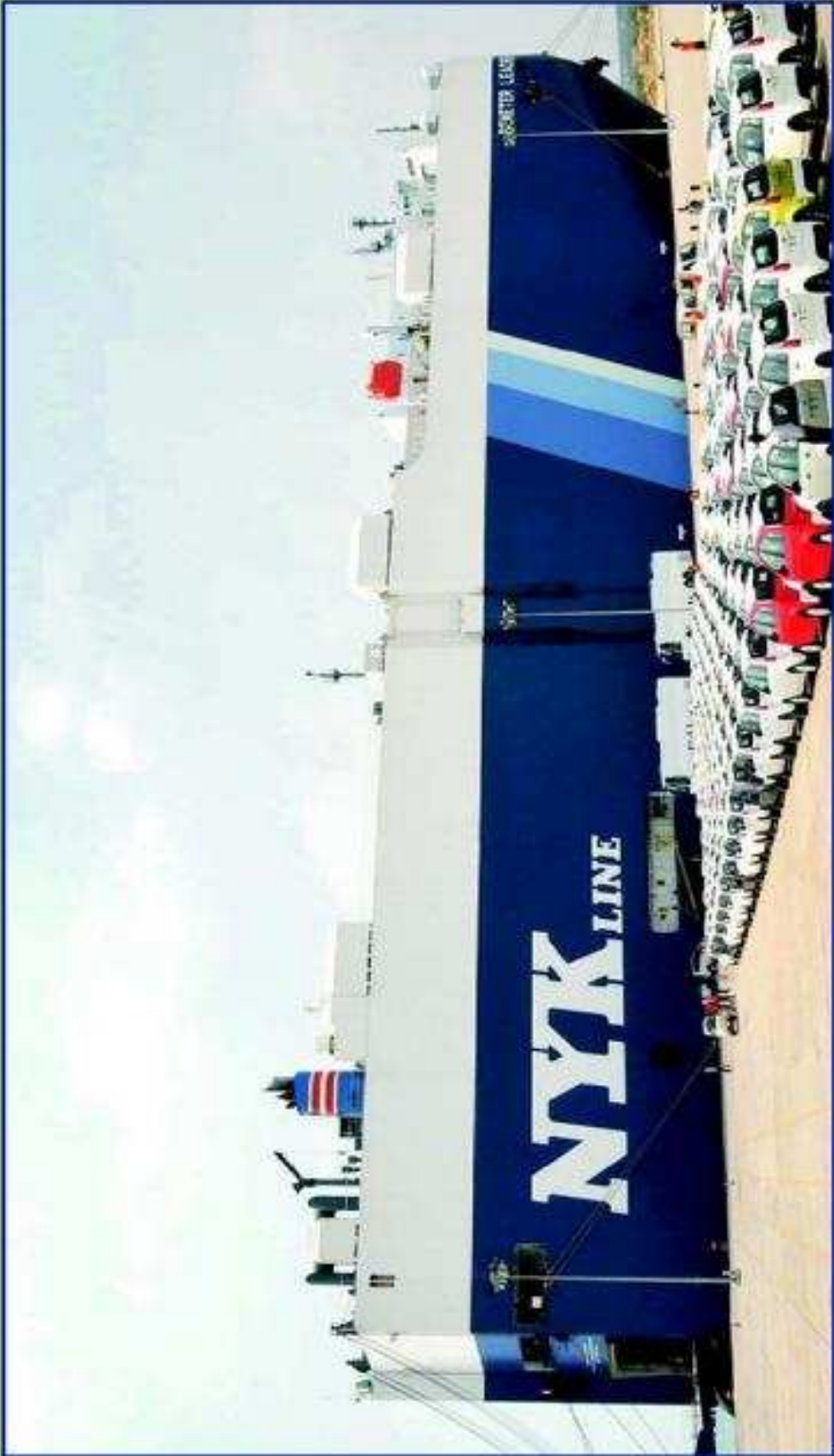
Car Export Operation at General Cargo Berth