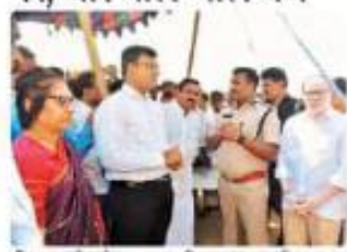
पत्रिका मूल नोटिस

सिवाल का उद्धार किए जा रहा है। इस बारे में पुलिस अधीक्षक ने बताया कि, घटना के बाद पुलिस ने छह युवकों को बचाया है। इनमें से चार बाल-बाल बचे हैं। पुलिस ने बताया कि, घटना के बाद पुलिस ने छह युवकों को बचाया है। इनमें से चार बाल-बाल बचे हैं। पुलिस ने बताया कि, घटना के बाद पुलिस ने छह युवकों को बचाया है। इनमें से चार बाल-बाल बचे हैं।